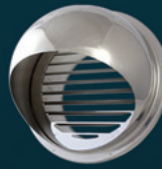
Model SFX-S 4" & 6" Stainless Steel