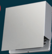
Model KXU 4" & 6" Aluminum