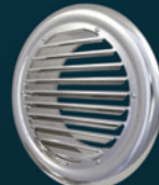
Model SX-S 4" & 6" Stainless Steel