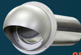
Model: SFB-P 4" & 6" Aluminum