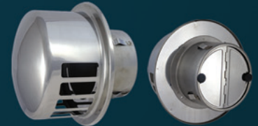
Model RCC-S 4" & 6" Stainless Steel