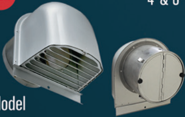
Model CFXC 4" & 6" Aluminum