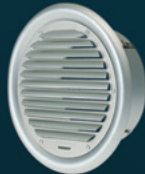
Model SX 3"-8" Aluminum