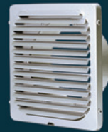
Model KX 3"-6" Aluminum