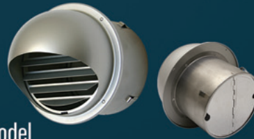
Model SFZC 4" & 6" Aluminum