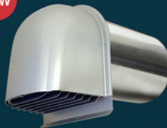
Model CFX-P 4" & 6" Aluminum