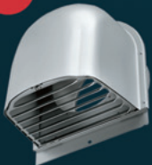
Model CFX 3"-12" Aluminum