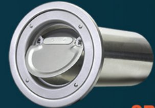
Model: SB-P 4" & 6" Aluminum