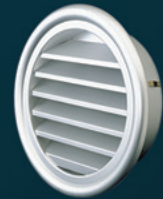
Model SXL 10"-16" Aluminum