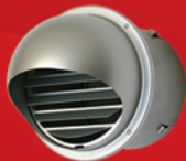
Model: SFZC 4" & 6" Aluminum