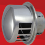
Model: RCC-S 4" & 6" Stainless Steel