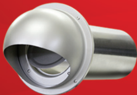
Model: SFB-P 4" & 6" Aluminum