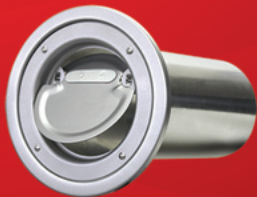
Model: SB-P 4" & 6" Aluminum