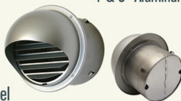
Model SFZC 4" & 6" Aluminum