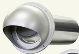
Model: SFB-P 4" & 6" Aluminum