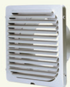
Model KX 3"-6" Aluminum