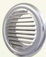
Model SX-S 4" & 6" Stainless Steel