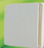
Model JSP 4" & 6" ABS Resin