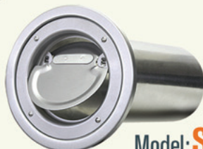
Model: SB-P 4" & 6" Aluminum