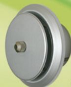
Model JRC 4" & 6" Aluminum