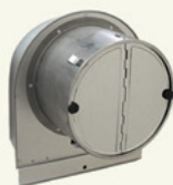
Model CFXC 4" & 6" Aluminum