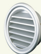
Model SXL 10"-16" Aluminum