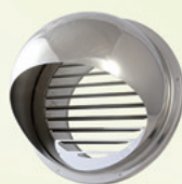
Model SFX-S 4" & 6" Stainless Steel