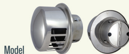
Model RCC-S 4" & 6" Stainless Steel