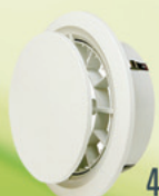
Model JRA 4" & 6" ABS Resin