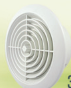
Model DK-M8 3", 4", 6" ABS Resin