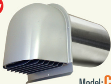
Model: CFX-P 4" & 6" Aluminum