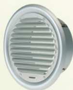
Model SX 3"-8" Aluminum