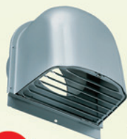
Model CFX 3"-12" Aluminum