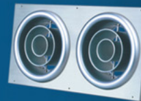
Model: NT-P (TurboNozzle Panel)