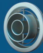
Model: NTX-R (Exposed Duct Mounted)