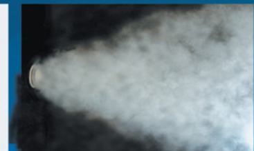
■ Diffusing Pattern