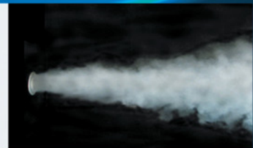
■ Straight Pattern

► If you are interested in becoming an authorized international distributor, please contact us. (Except the United States/Canada/Mexico/Japan)