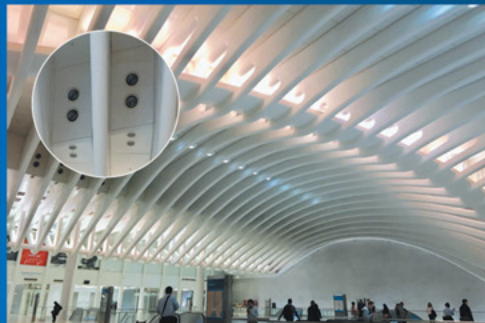
World Trade Center Station New York, NY