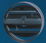
Model: BS (Butterfly Damper)