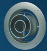
Model: NTX (Surface Mounted)