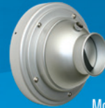
Model: PK-R with Round Duct Adapter