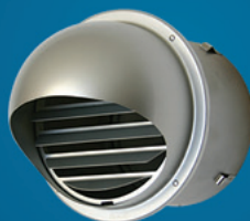
Model: SFZC 4" & 6" Aluminum