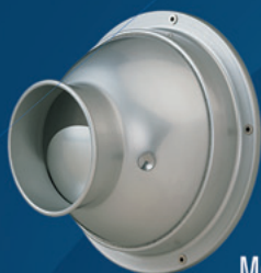
Model: PK 3" - 20" Aluminum