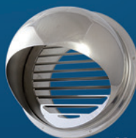
Model: SFX-S 4" & 6" Stainless Steel