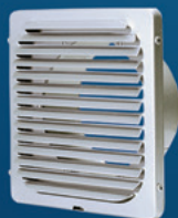
Model: KX 3" - 6" Aluminum