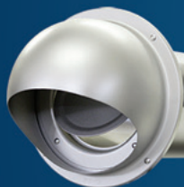
Model: SFB-P 4" & 6" Aluminum