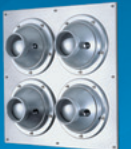
Model: PKP SpotPac