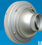
Model: PK-R with Round Duct Adapter