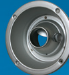
Model: PK-A Air Shower Nozzle