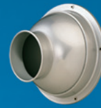
Model: PK-E without Damper