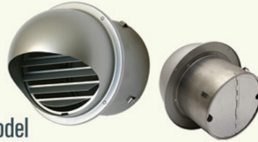
Model SFZC 4" & 6" Aluminum