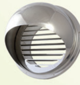
Model SFX-S 4" & 6" Stainless Steel