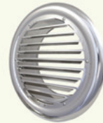
Model SX-S 4" & 6" Stainless Steel