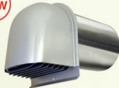
Model CFX-P 4" & 6" Aluminum