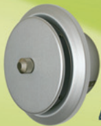
Model JRC 4" & 6" Aluminum