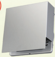
Model KXXU 4" & 6" Aluminum