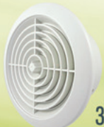
Model DK-M8 3", 4", 6" ABS Resin