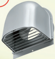
Model CFX 3" - 12" Aluminum