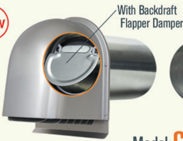
Model: CFXF-P 4" & 6" Aluminum