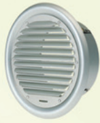
Model SX 3" - 8" Aluminum