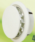
Model JRA 4" & 6" ABS Resin