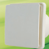
Model JSP 4" & 6" ABS Resin

► If you are interested in becoming an authorized international distributor, please contact us. (Except the United States/Canada/Mexico/Japan)