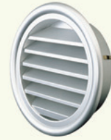
Model SXL 10" - 16" Aluminum