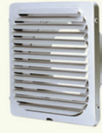
Model KX 3" - 6" Aluminum