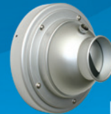
Model: PK-R with Round Duct Adapter