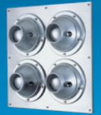
Model: PKP SpotPac