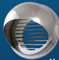
Model: SFX-S 4" & 6" Stainless Steel