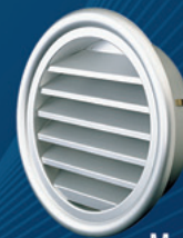
Model: SXL 10" - 16" Aluminum

► If you are interested in becoming an authorized international distributor, please contact us. (Except the United States/Canada/Mexico/Japan)