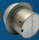
Model: RCC-S 4"& 6" Stainless Steel