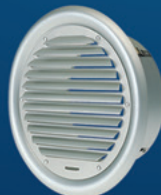
Model: SX 3"- 8" Aluminum