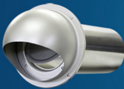
Model: SFB-P 4"& 6" Aluminum