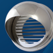
Model: SFX-S 4"& 6" Stainless Steel