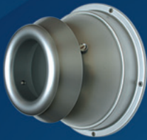
Model: PK-K 6"- 20" Aluminum