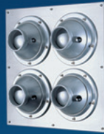
Model: PKP Aluminum & Stainless Steel