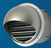
Model: SFZC 4"& 6" Aluminum