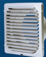
Model: KX 3"- 6" Aluminum