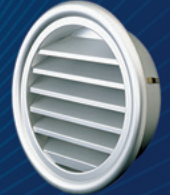
Model: SXL 10"- 16" Aluminum

► If you are interested in becoming an authorized international distributor, please contact us. (Except the United States/Canada/Mexico/Japan)