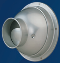
Model: PK 3"- 20" Aluminum