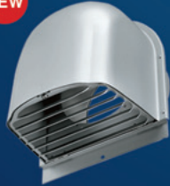
Model: CFX 3"- 12" Aluminum