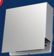
Model: KXU 4"& 6" Aluminum