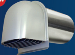
Model: CFXF-P 4"& 6" Aluminum