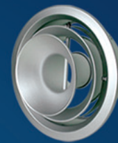
Model: NX 6"- 16" Aluminum