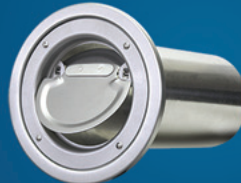
Model: SB-P 4"& 6" Aluminum