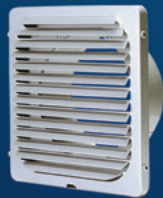
Model: KX 3"- 6" Aluminum