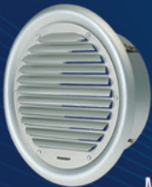
Model: SX 3"- 8" Aluminum