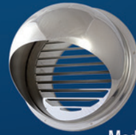
Model: SFX-S 4" & 6" Stainless Steel