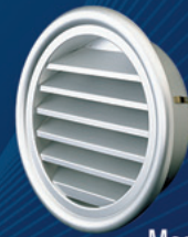
Model: SXL 10"- 16" Aluminum

► If you are interested in becoming an authorized international distributor, please contact us. (Except the United States/Canada/Mexico/Japan)