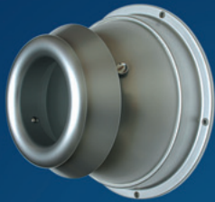
Model: PK-K 6"- 20" Aluminum