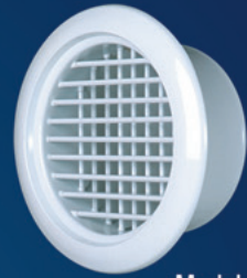
Model: RHV 6"- 24" Aluminum