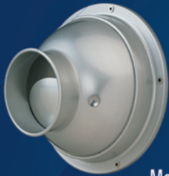
Model: PK 3"- 20" Aluminum